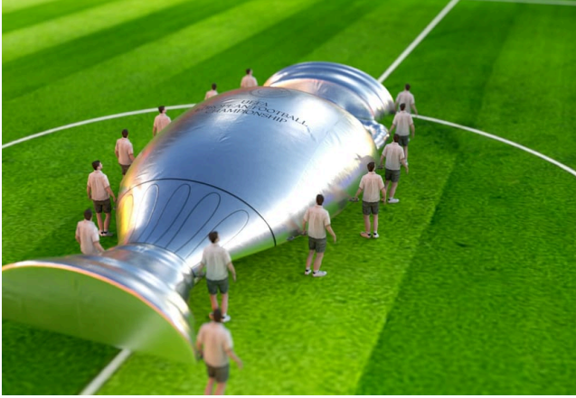
UEFA EURO 2024 OPENING CEREMONIES · 2024

Six excerpts from recent years — from Europe's largest sports stage to a curated children's-fashion presentation. Every project: concept and build delivered by one team.