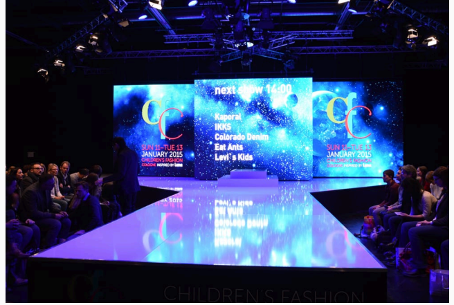
CFC Cologne RUNWAY · COLOGNE · SINCE 2014