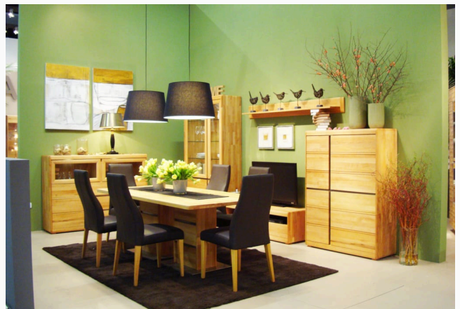
IMM Cologne FURNITURE TRADE FAIR · COLOGNE