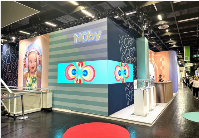
Nuby KIND + JUGEND · COLOGNE · 2025