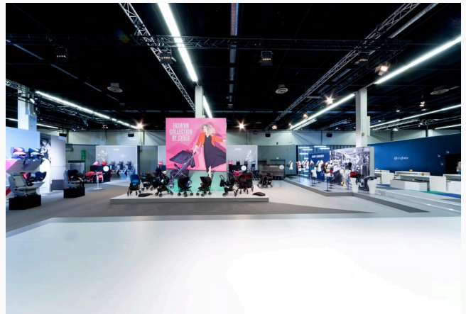
Cybex KIND + JUGEND · COLOGNE · 2019